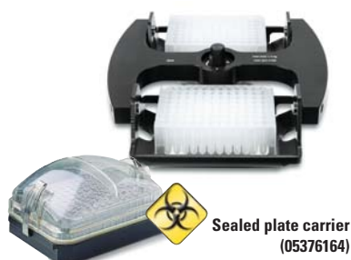
Sealed plate carrier (05376164)