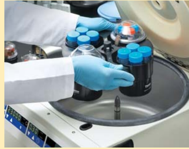
2. Instantly unfasten and remove it.