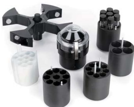
T41 high-capacity swing-out rotor (05376124) shown with a 280 ml standard bucket (05376125) and sealing lid (05376126) along with a variety of inserts to meet your specific application requirements