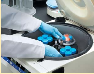
1. Snap in your swing-out rotor and lock it in place.