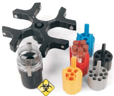
S41 swing-out rotor (05376104) shown with a 200 ml standard bucket (05376105) and sealing lid (05376106) along with adapters for a variety of applications