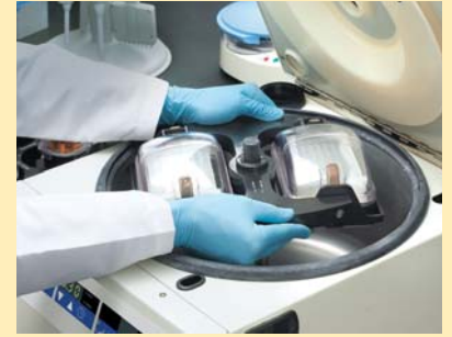
3. Snap in your microplate rotor, and you're ready to spin again – in less than 5 seconds!